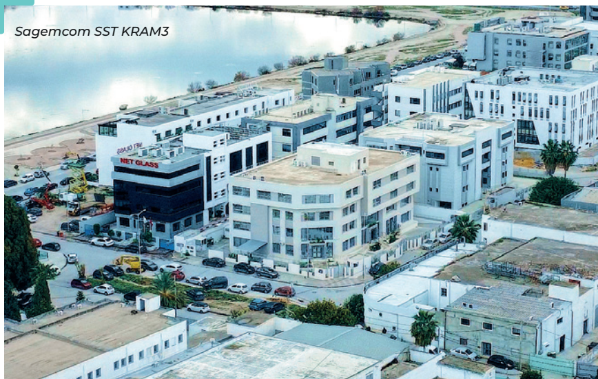
Sagemcom SST KRAM3

The Group's growth strategy has seen a significant increase in investments in R&D (resources, tools, human resources, premises, etc.). Our R&D centres have also been extended. In Tunisia, new offices have been opened, so all employees can now enjoy better working conditions (larger workspaces, creation of new laboratories, etc.).